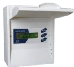
design IP 40