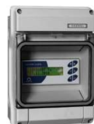
design IP 65