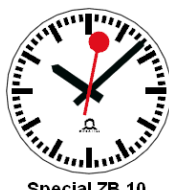
Special ZB 10 second hand