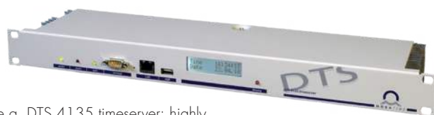
e.g. DTS 4135.timeserver; highly accurate multipurpose timeserver

The DTS 480x.masterclock is part of the Distributed Time System, developed by Moser-Baer AG. Various devices, such as master clocks and time servers are being connected via standard LAN (Ethernet). The whole DTS is synchronized, monitored and operated through the LAN; this includes remote operation control, supervision and error handling, e.g. via Management software MOBA-NMS.